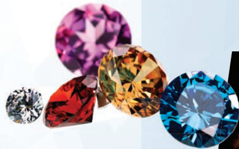
Rainbow colors shine from quartz crystals.